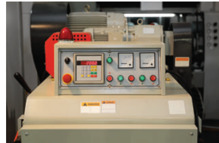
Heavy Industrial Machines