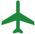
Aerospace & Defense

For your convenience, we organize Alpha Wire offerings around specific markets so that you can easily find the products you need for comparable use cases – products with the best match of performance, reliability and fit for your specific requirements.